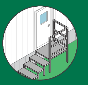
EXTERIORS Ramps, steps, security, canopies